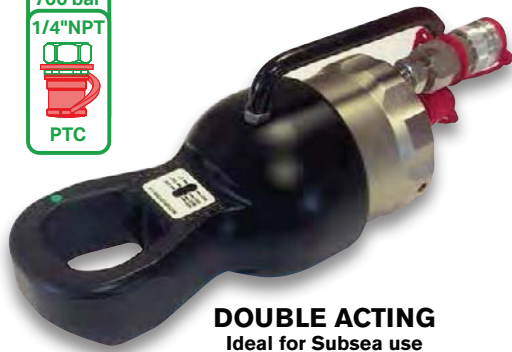
DOUBLE ACTING Ideal for Subsea use